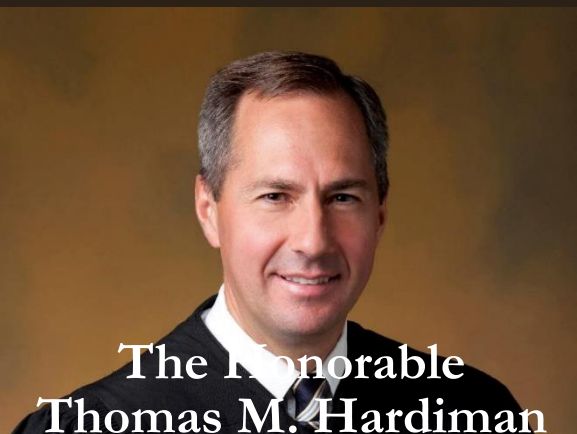
The Honorable Thomas M. Hardiman